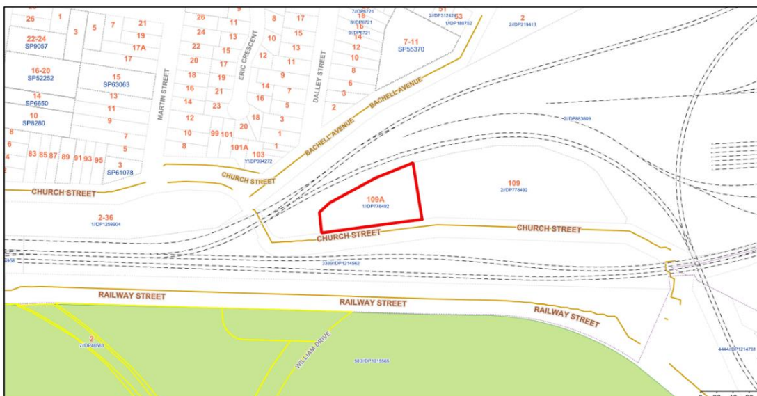
Figure 2: Location map of subject site