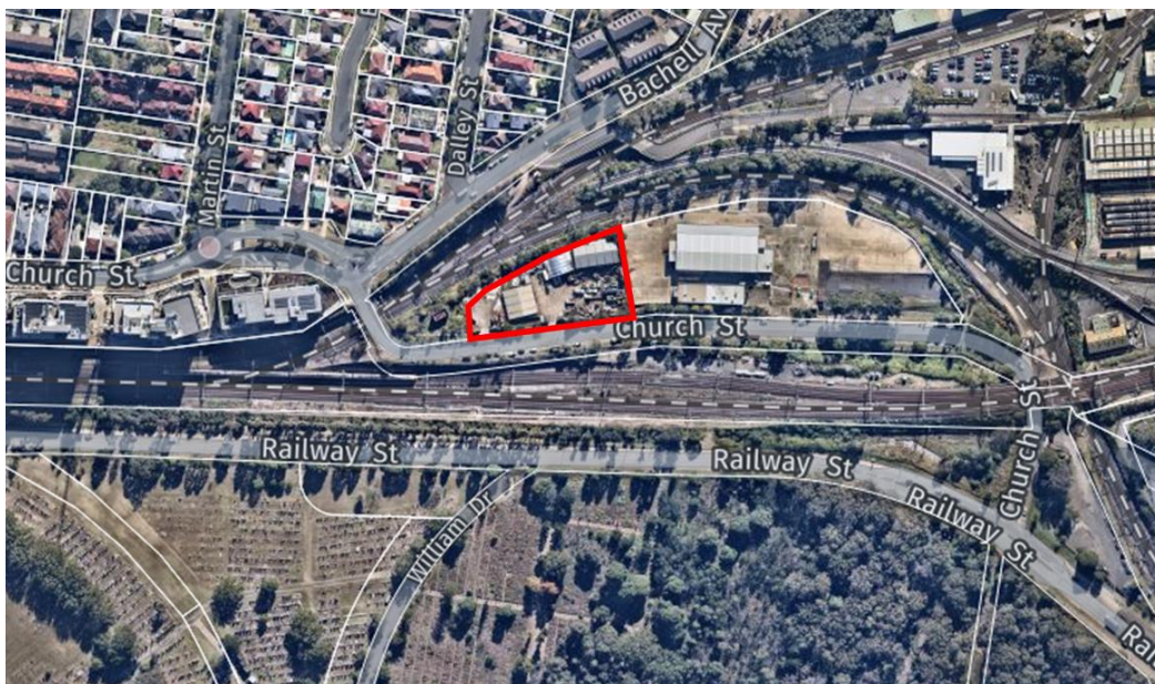
Figure 4: The Locality