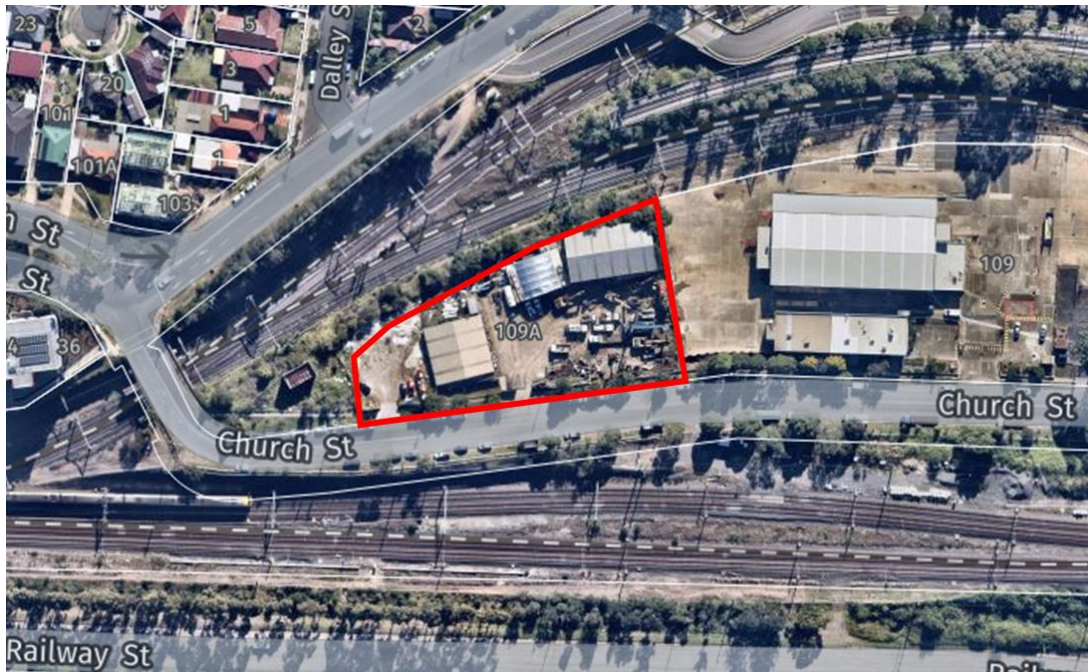
Figure 1: The Site

The site is located within an area zoned E4 General Industrial under the Cumberland Local Environmental Plan 2021 and is bordered by railway land to the north and west, Church Street to the south and a pallet manufacturing/distribution centre to the east.