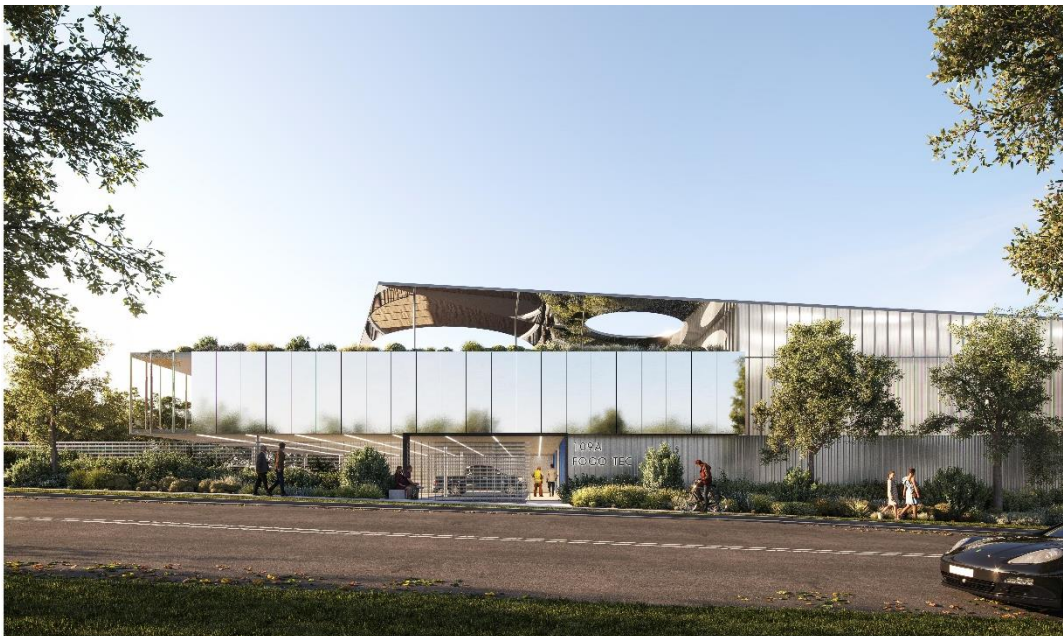
Figure 5: Photomontage of proposed facility as viewed from Church Street (Source: Fuse Architects)

The proposed waste transfer facility provides for a warehouse type building with a maximum height of 10.1m. The building provides an area for operations at ground level including space for the stockpile, weighbridges, odour management systems and car parking. The first floor level is cantilevered above the proposed parking area and odour management system and provides amenity for future staff through the provision of a rooftop terrace with associated green roof.